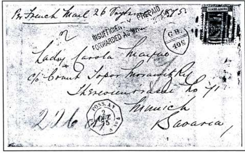
Figure MM-75-22. MM Anadyr collided with Teviot ; Unique "GB/40c" from Far East

Rate to GB for letters by French paquebots lowered on 29.4 to be same as if sent by British packet: 30c. This 3.5 cover represents the earliest possible use of the new 30c French paquebot rate to GB.