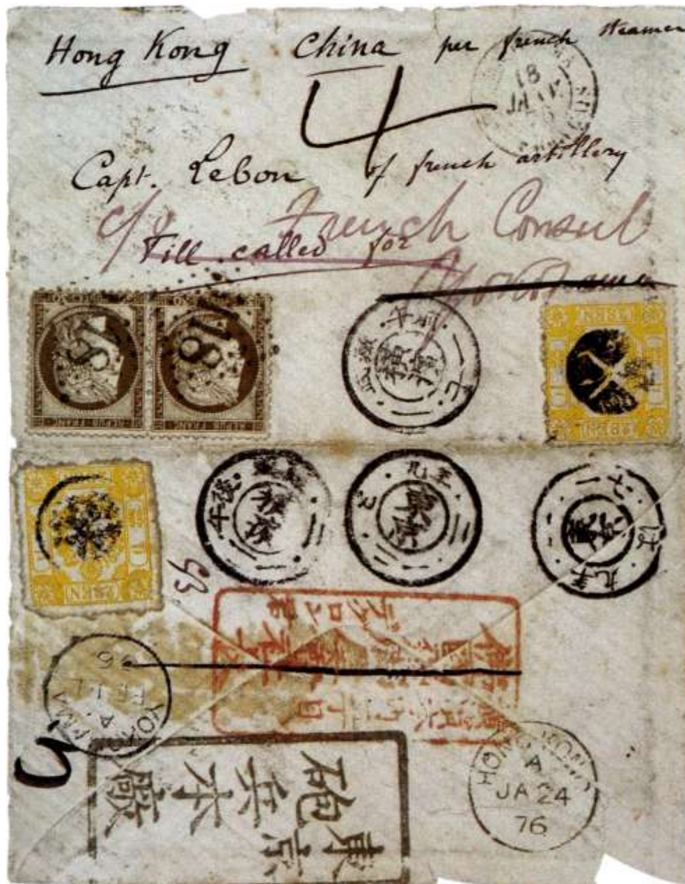
Figure MM-76-9. Only known use of 2 different Japanese routing handstamps on 1 cover