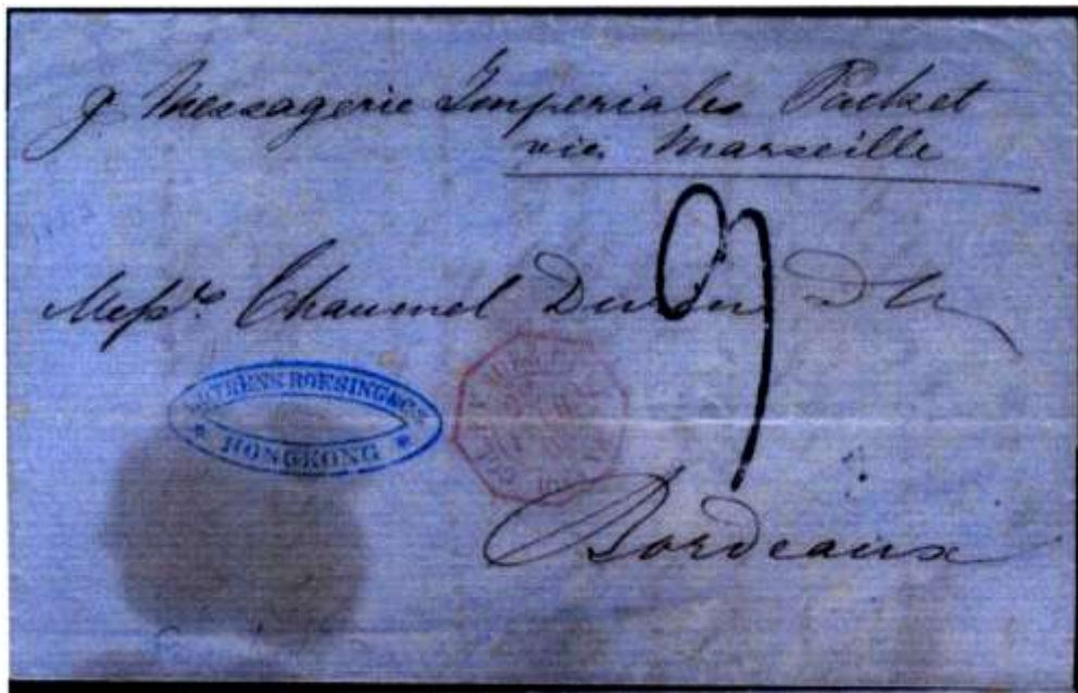
Figure MI-63-6. Earliest known cover from Far East carried by MI: 2.63 from Hong Kong

The Figure MI-63-2 cover is earliest of only three known covers so forwarded.