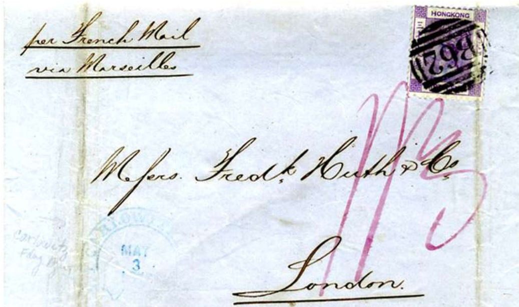
Figure MM-72-11. Ava “arrested” due to collision with Rona; earliest 30c rate by MM

MM Ava was detained at Hong Kong by an official inquiry into her collision with and sinking of the Rona . The Hong Kong Marshall “arrested” the Ava as security against any damages which might be awarded. After a near international incident, also involving the French iron-clad Alma , the situation was resolved.