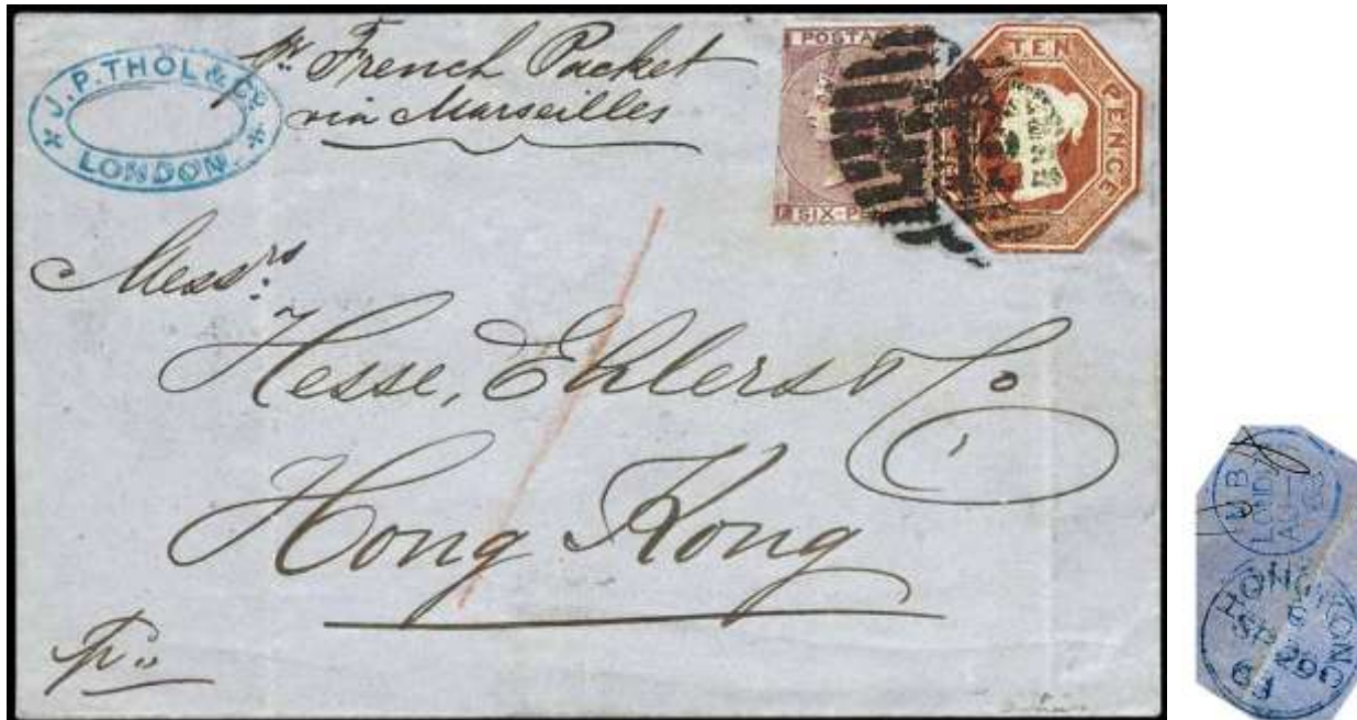
Figure MI-63-2. Earliest known cover carried by French MI paquebot to Far East

British mail had to be forwarded by special agents at Marseille for the first 18 months of French packet service to the Far East, since the British PO had not yet agreed to officially use the French service.