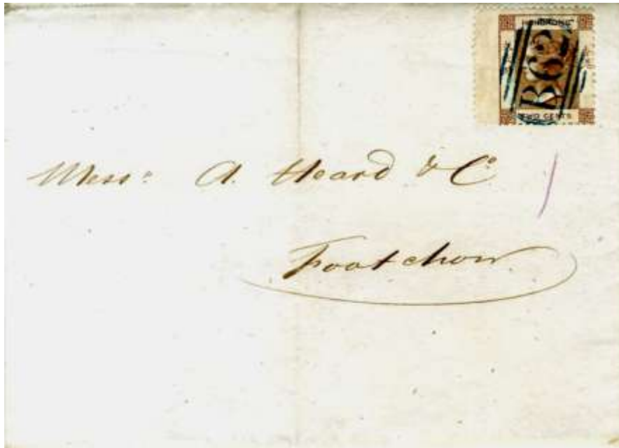
Figure MI-64-5. Earliest printed matter by MI; MI Saigon to Singapore, P&O to Foochow