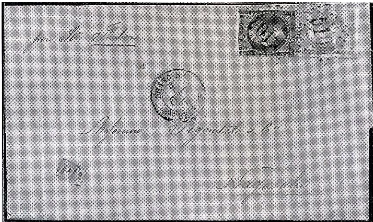
Figure MI-70-2. Only known cover by Thabor ; 1 st through Suez Canal; only trip to Orient

From the 18.1.70 and 26.1.70 "China Mail" (Hong Kong)