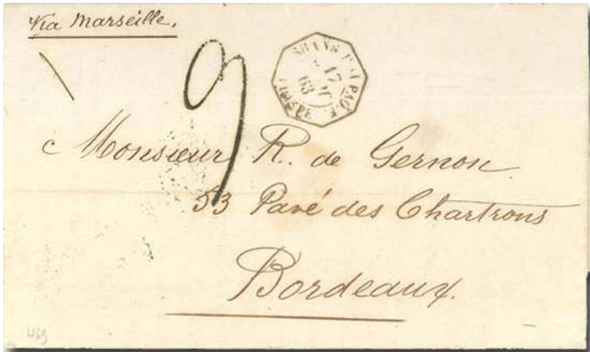
Figure MI-63-13. Earliest of only 2 known “Shang-hai Paq. F. / Hydaspé” on unpaid cover Salles recorded only in 1863-64: rated “RR;” only recorded on letters franked with French stamps