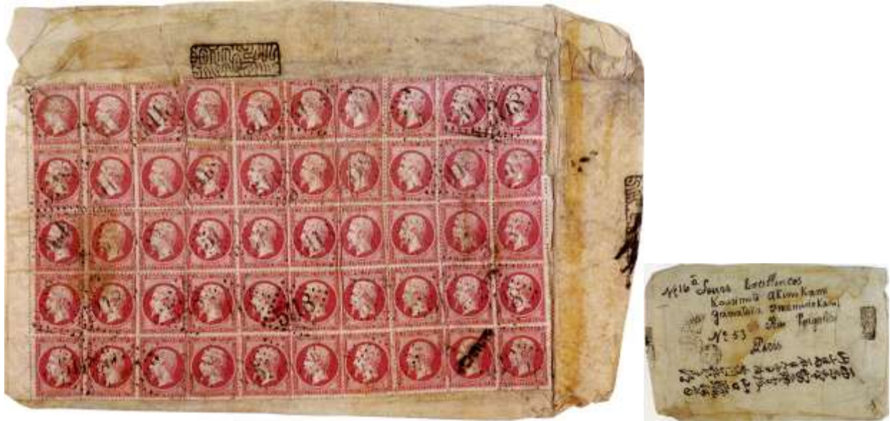
Figure MI-68-7. Highest known postage on cover by French paquebot: 50 \times 80c = 40f

Mr. Jun Ichi Matsumoto: Largest known used block