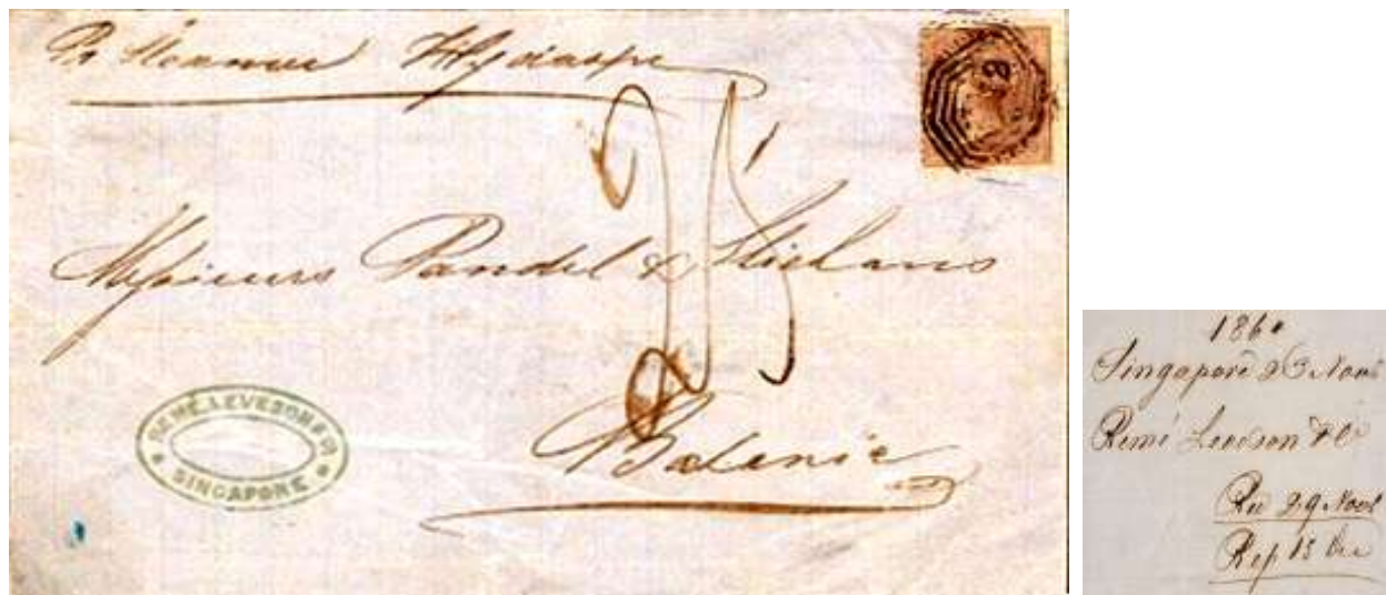
Figure MI-64-13. Only recorded cover saved from wreck of French paquebot Hydaspe

MI Hydaspe transferred from Hong Kong–Shanghai branch line to Singapore–Batavia branch line. Hydaspe left Singapore on 24.11.64 on first voyage to Batavia; ran upon a reef about 25 miles out. Berberin, the French postal agent, was taken off the Hydaspe , along with the mails and passengers, by the crew of the Dutch packet Java , and transported on to Batavia.