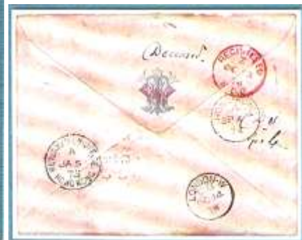
Figure MM-74-19. Earliest known registered in Hong Kong and sent by French paquebot

Addressee determined as deceased, cover so annotated on the back, and sent back to Hong Kong.