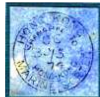
Figure MM-74-24. 1 of 3 known with Marine Sorter marks sent from Shanghai by MM

This 24.10 cover from Hankow was carried by the MM Iraouaddy from Shanghai 30.10 to Hong Kong 2.11. Only three known by French paquebot that bear “Hong Kong / Marine Sorter / Shanghai to / Hong Kong.” It is believed that this mail for Hong Kong was sorted in port on the day that the MM steamer left Shanghai.