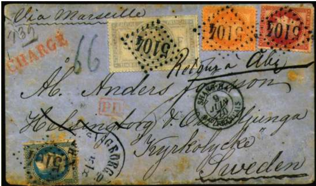
Figure MI-70-12. Earliest from Orient by MI paquebot: 1) registered, 2) to Scandinavia

If 20c / 10 grams postage from Japan to Europe + 50c registration: 1866 -71