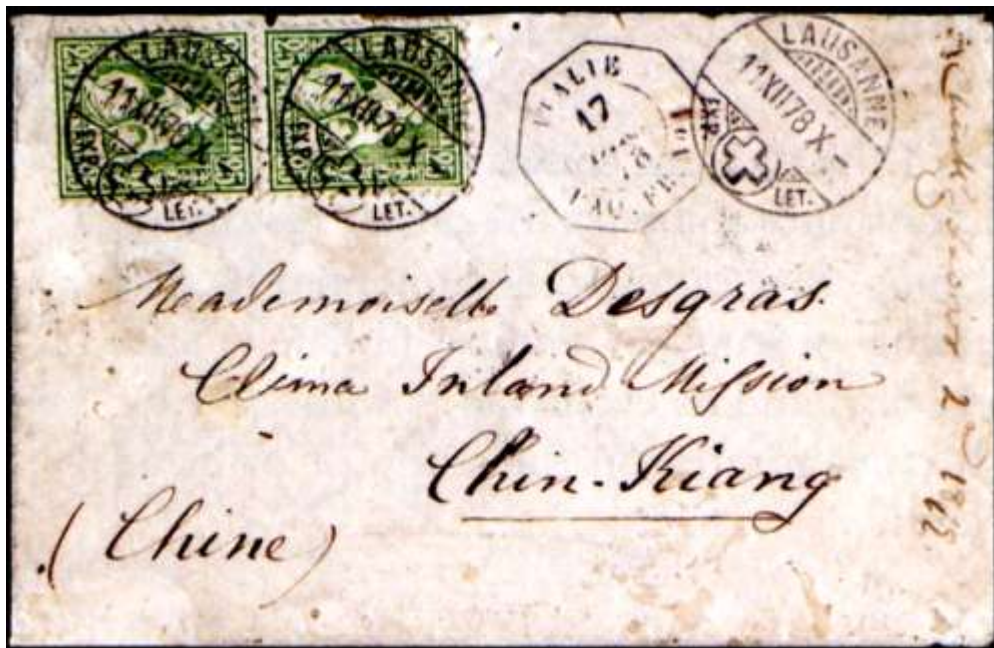
Figure MM-79-1. Only known “Italie / Paq. Fr.” datestamp on cover to or from Far East MM Yangtse departed Marseille on 15.12, and picked up this letter at Naples