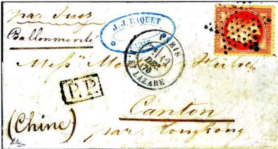
Figure MM-71-2. Only cover to China that escaped Paris per “Ballon Monte;” then by MM

Carried over the German lines by the balloon "Ville de Paris."