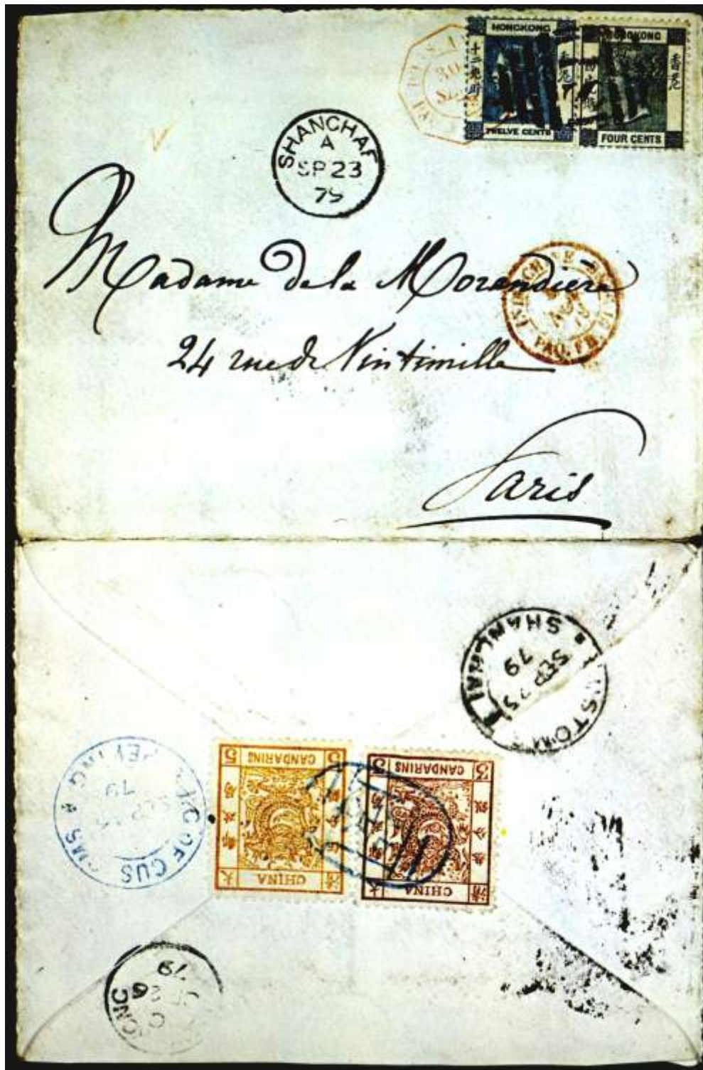
Figure MM-79-22. I. G. Customs / Peking by MM; earliest “ . . . Modane” c.d.s. from China

Cover paid at double the 8c per ½ ounce second UPU rate, but the 8 candarin franking was a single rate. Red “Poss Angl. / Paq. Fr. N” (Salles Type 1.933) applied onboard when MM Iraouaddy left Hong Kong. Red “Indo-chine / Paq. Fr. Modane” c.d.s. was applied to letters transported through the Mt. Cenis tunnel.