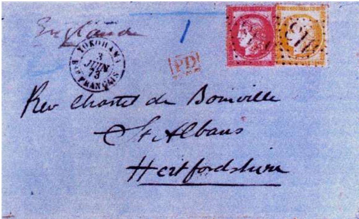
Figure MM-73-7A. Earliest known sent abroad through Japanese postal service