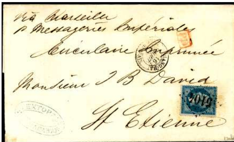
Figure MI-64-8. Earliest French-franked imprime from Orient carried by MI to Europe No 20c imprime rate recorded by Salles nor Matsumoto, so this item was apparently overpaid.