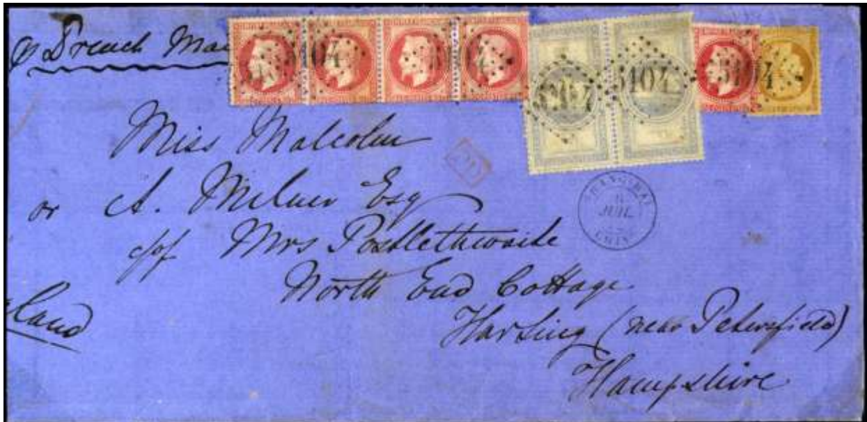
Figure MM-72-15. Highest postage at foreign rate by French packet: 12 \times 1f\ 20c = 14f\ 40c

Dr. Robert Spaulding: “reasonable inference” for the 500 gram weight of the package was that it “ contained gold coins or bullion , wrapped in cloth or paper, to pay the expenses of the Japanese delegation in Paris” (Paris International Exhibition).