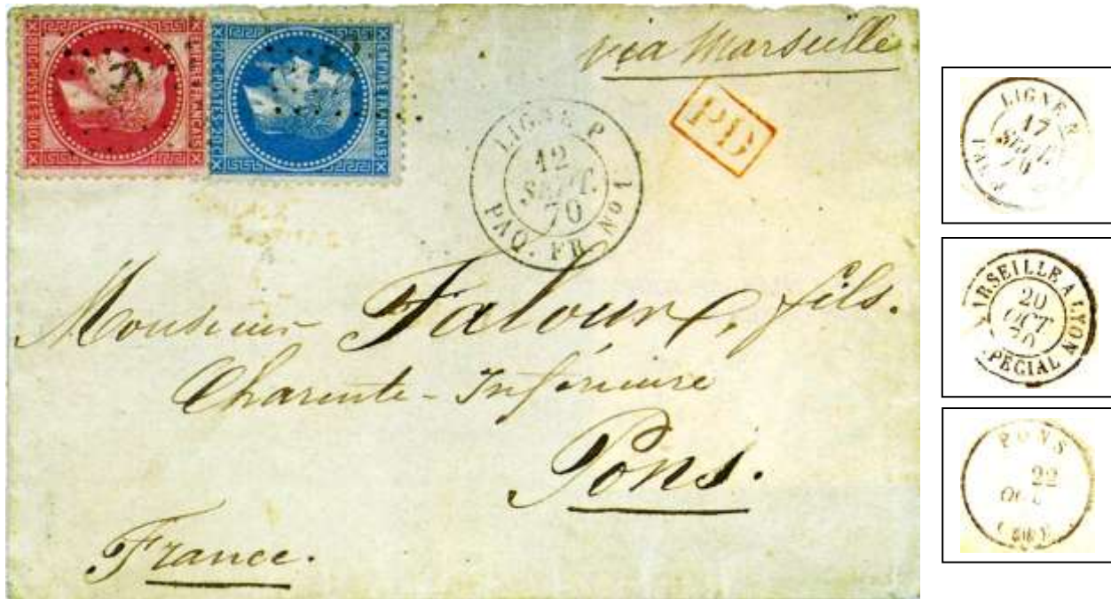
Figure MI-70-16. Earliest by MI from Batavia; “Ligne P / Paq Fr. No 1,” piece d’amateur

Transported by MI Capitole from Batavia (12.9) to Singapore (c.14.9, then by the MI Donnai Earliest use of the “Ligne N / Paq Fr. No 8” c.d.s. recorded by Salles (Type 1.921/8).