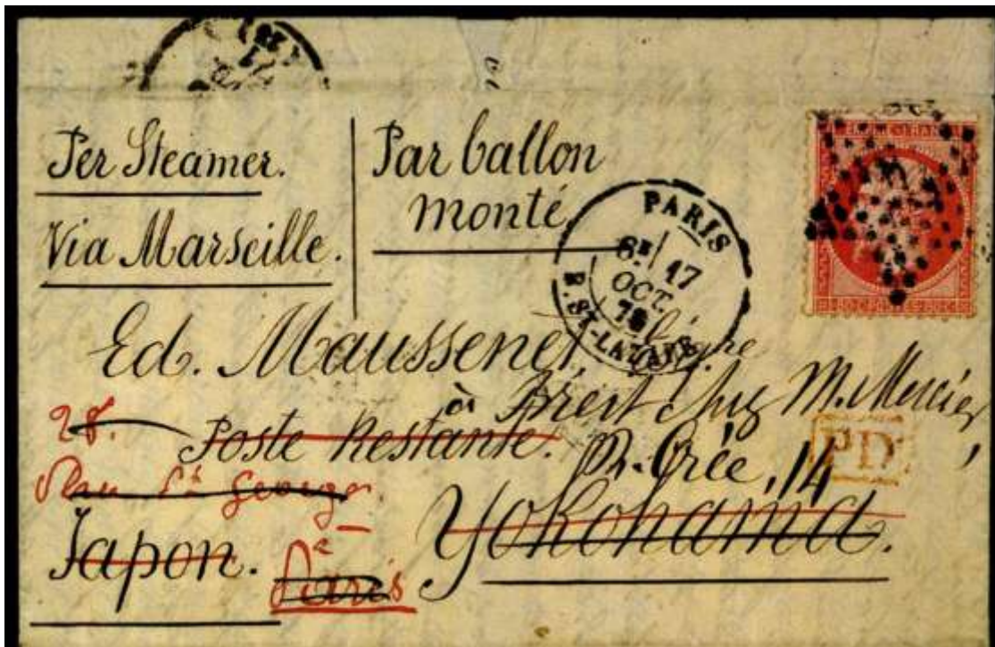
Figure MM-71-9. Balloon Monte returned to France on 1st Westward voyage of Provence

Possibly sent to connect with the P&O at Brindisi or Suez, but most likely carried by the MM Hoogly 1 Ballon Monte cover to Hong Kong, and 3 to Japan are also known