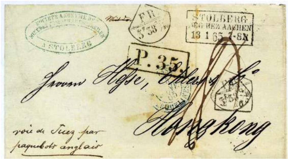
Figure MI-65-2: “3 F 38 4 / 10 c” Accountancy mark cover per MI – Earliest of only 2 recorded Rerouted from P&O to MI to provide more expeditious transmission. Re-rated for French packet service: “FR./2F16c” mark over-struck by “3 F 38 4 / 10 c” accountancy marking Subject of Hong Kong Study Circle Journal and “Postscript” articles by Scamp & Bohn