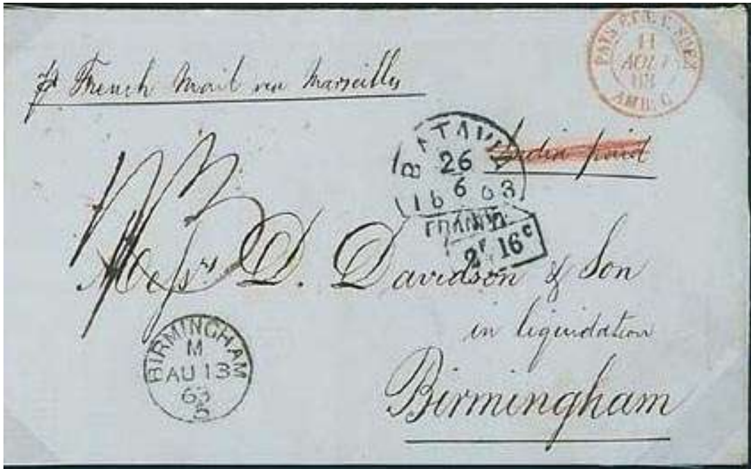
Figure MI-63-11. Earliest from Batavia by MI from Singapore; “2F 16c” accountancy mark Only example Bohn recorded of this accountancy marking on mail from east of Suez